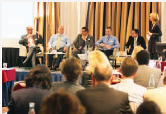
IFAH-EUROPE ANNUAL CONFERENCE