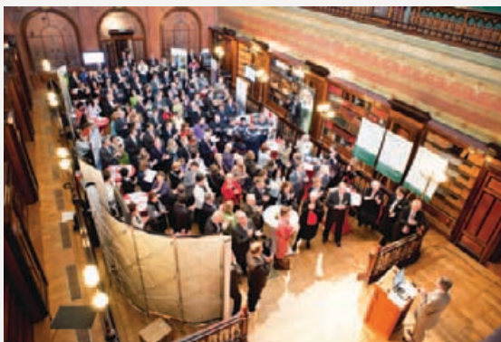
IFAH-EUROPE EUROPEAN PET NIGHT

IFAH-Europe also played a key role in the formation of the European Technology Platform for Global Animal Health (ETPGAH), which aims to identify major disease risks and accelerate the development of tools with which to control them effectively. As part of this initiative, a Disease Control Tools ('DISCONTTOOLS') database is under development. The database will identify gaps in our ability to control over 50 key diseases, and will help to coordinate research on the development of effective diagnostic, vaccine and pharmaceutical products. Significant progress was achieved during 2011, with information on 30 of those targets available on the DISCONTTOOLS public database ( www.discontools.eu ) by the end of the year.