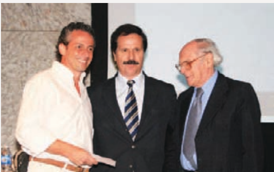
CAPROVE AWARD CEREMONY

The impact of veterinary products on the quality and productivity of food animals was also stressed by SINDAN at major livestock and poultry producer congresses held during the year. The association's role transcends national boundaries, with SINDAN sponsoring the Pan American Health Organisation's campaign against foot-and-mouth disease in Ecuador. The number of FMD outbreaks reported there fell to just four in 2011, compared with 49 in the previous year.