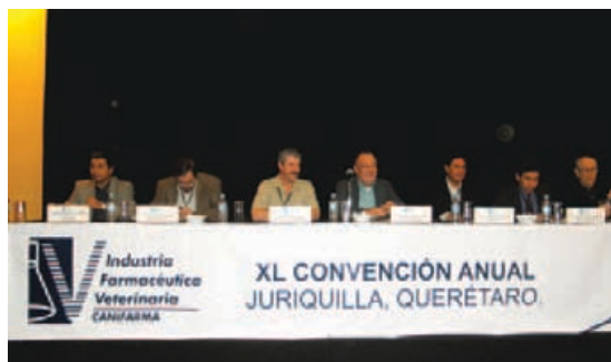
INFARVET ANNUAL CONGRESS