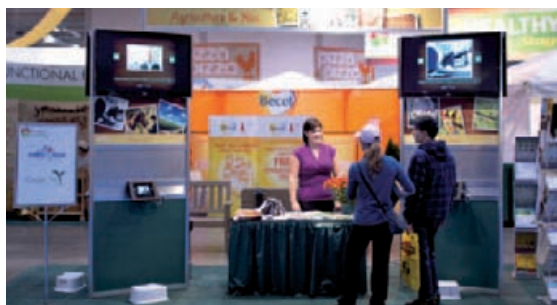
CAHI STAND AT THE ROYAL AGRICULTURAL WINTER FAIR IN TORONTO

INFARVET collaborated with the Mexican Ministry of Agriculture on the production of a guide to the responsible use of veterinary medicines. Government representatives were also in attendance at the association's highly successful annual conference, which addressed 'Competitiveness, international trade and regulation regarding globalisation'.