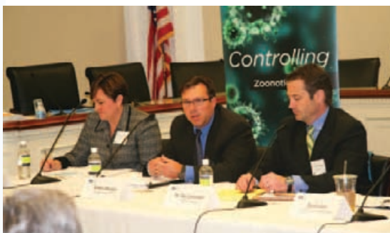
AHI "MAKING FOOD SAFER" EVENT